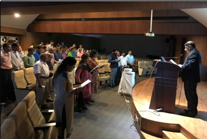
World No Tobacco Day was observed on 8th May 2019 by conducting a knowledge session and a pledge ceremony at Head Office to sensitize employees about harmful effects of tobacco use and to desist from tobacco use.