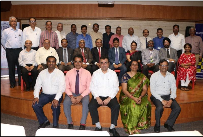
'Masterclass for Directors' by Institute of Directors India leading to Certified Corporate Directorship was conducted in-house at Shipping House, Mumbai from 11th-13th July 2019 for SCI's functional Directors and Senior Executives.