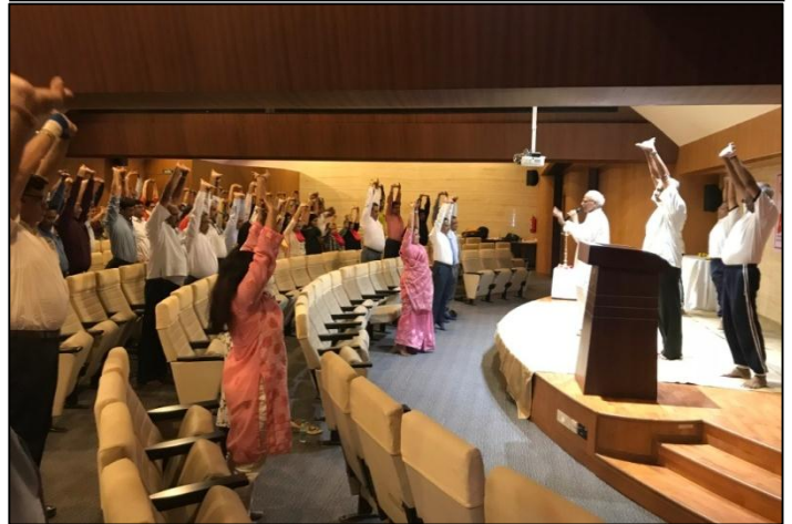
On the occasion of 5th International Yoga Day on 21.06.2019, SCI organized a yoga workshop in Head Office to disseminate the information about the benefits of practicing Yoga and encourage employees for practicing it for healthy and well being.